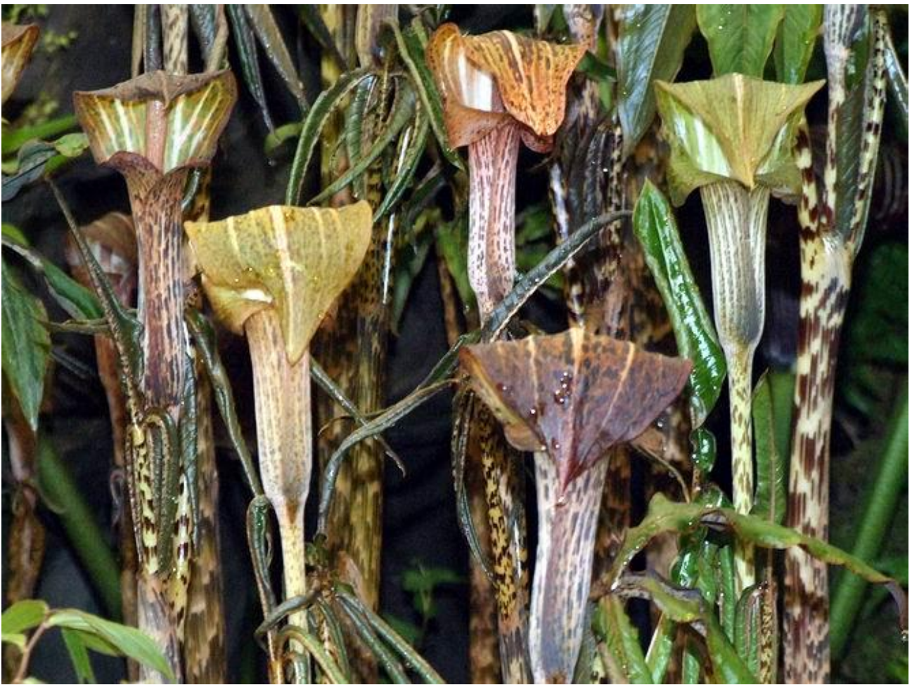
Arisaema nepenthoides : Getting in close lets you see the mysterious beauty of these flowers that always make me think they are like something straight from the Jurassic period.