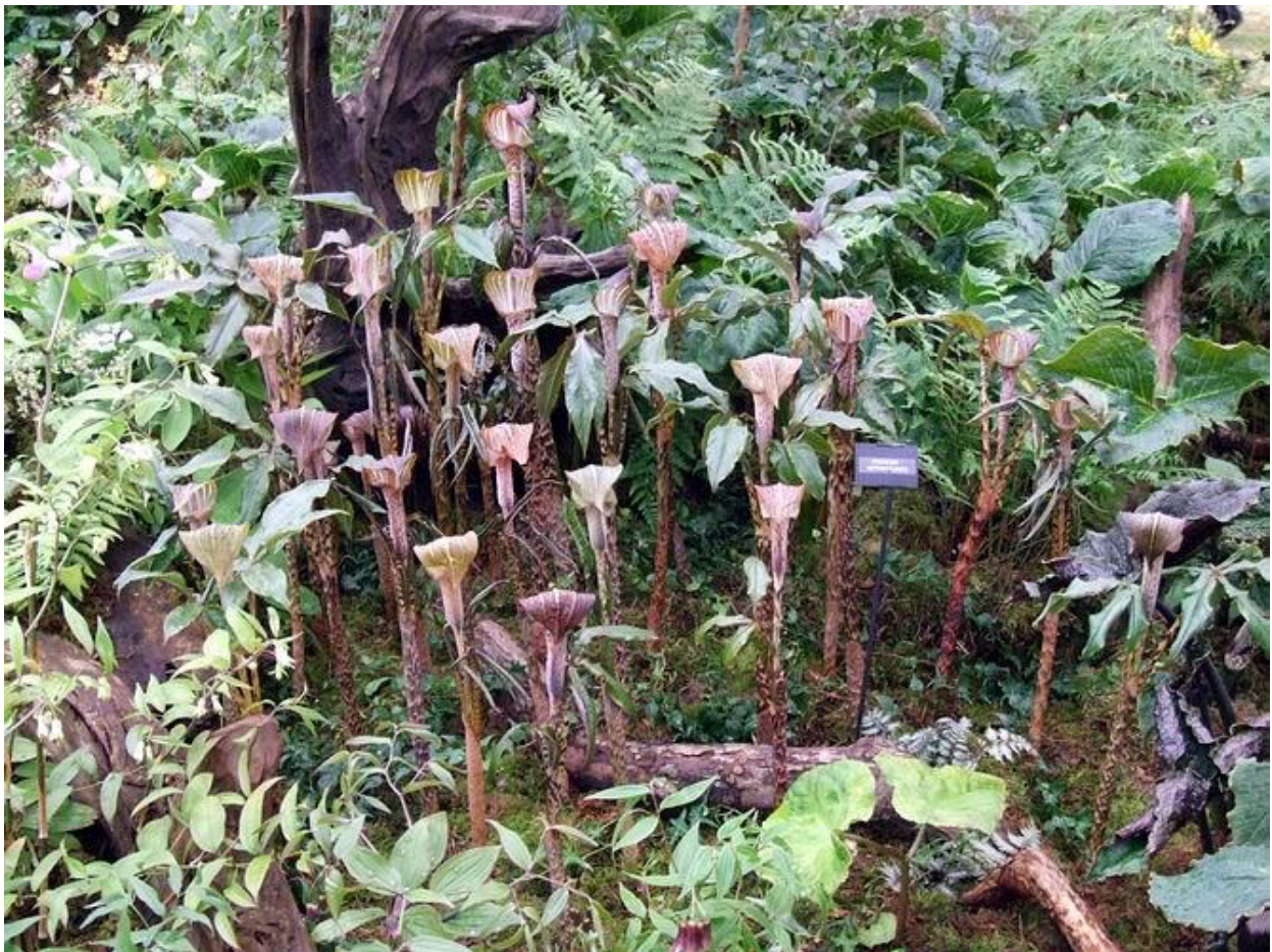
Arisaema nepenthoides 1

It is a very skilled process involving large refrigerated containers which allows them to display both summer and spring bulbs all together flowering, out of season, for the Chelsea Show.