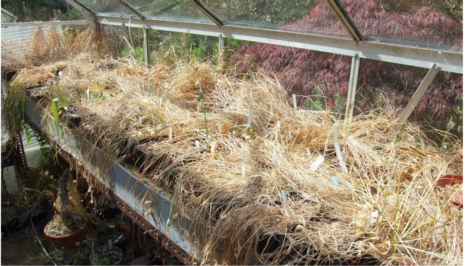
Bulb house dry foliage

It is just as well that the bulbs have gone dormant as we have had such a busy week with the SRGC Aberdeen Show on Saturday, a house full of guests all weekend, working for the BBC on Sunday and then off to Chelsea on Monday, that I have had little time to look at them.