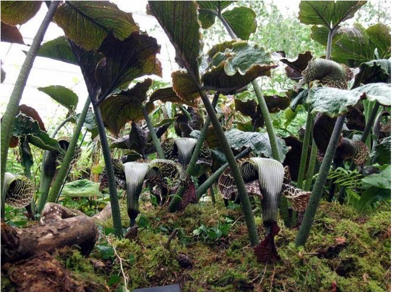
Plenty of Arisaema griffithii were also spread around this large display with a concentration towards one corner.