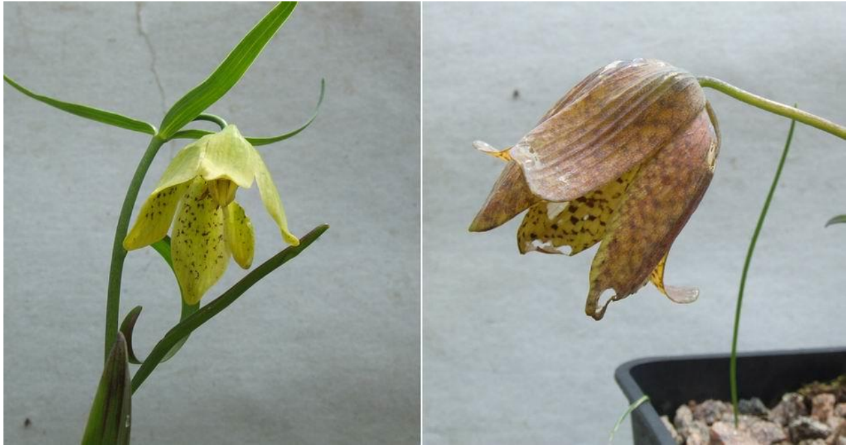
Fritillaria lixianensis and delavayi

I did check the seed situation last week before we launched into our busy period and I removed many of the Narcissus stems with ripe pods on. It is perfectly acceptable to collect the seed at this stage: it is ripe, it is just a bit brown rather than black as you can see from the picture. I will store this seed in dry sand until I sow it in September – more on this next week.