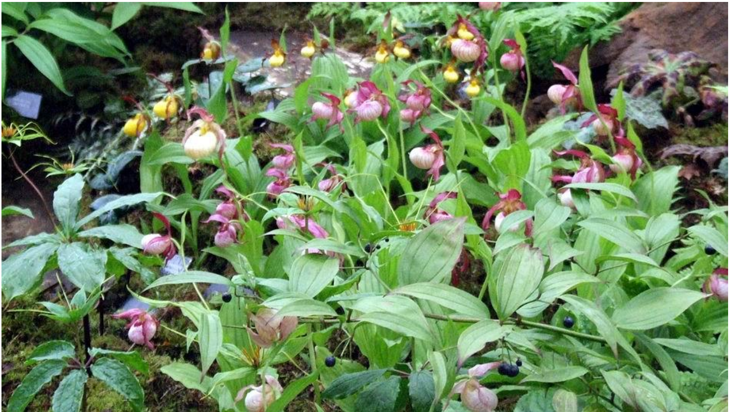
Cyripediums galore, both species and hybrids as well as a generous scattering of Paris species.