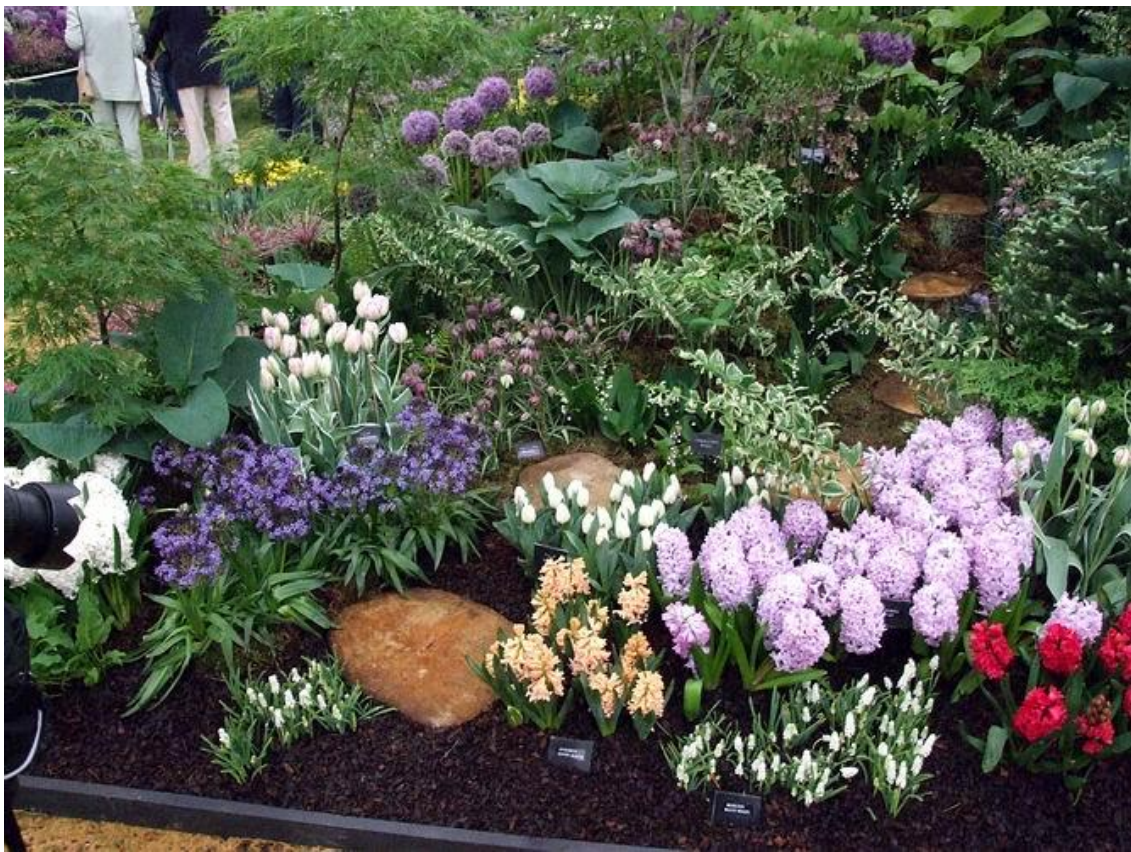
Spring and summer bulbs

It is a very skilled process involving large refrigerated containers which allows them to display both summer and spring bulbs all together flowering, out of season, for the Chelsea Show.