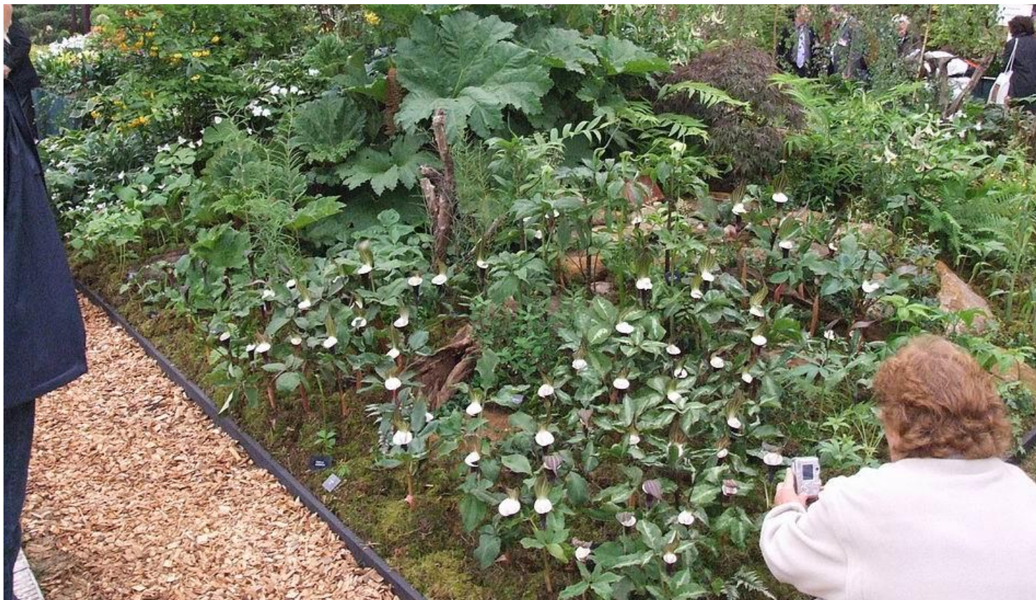
What about this mass planting of Arisaema sikokianum - fancy that in your garden? I do.