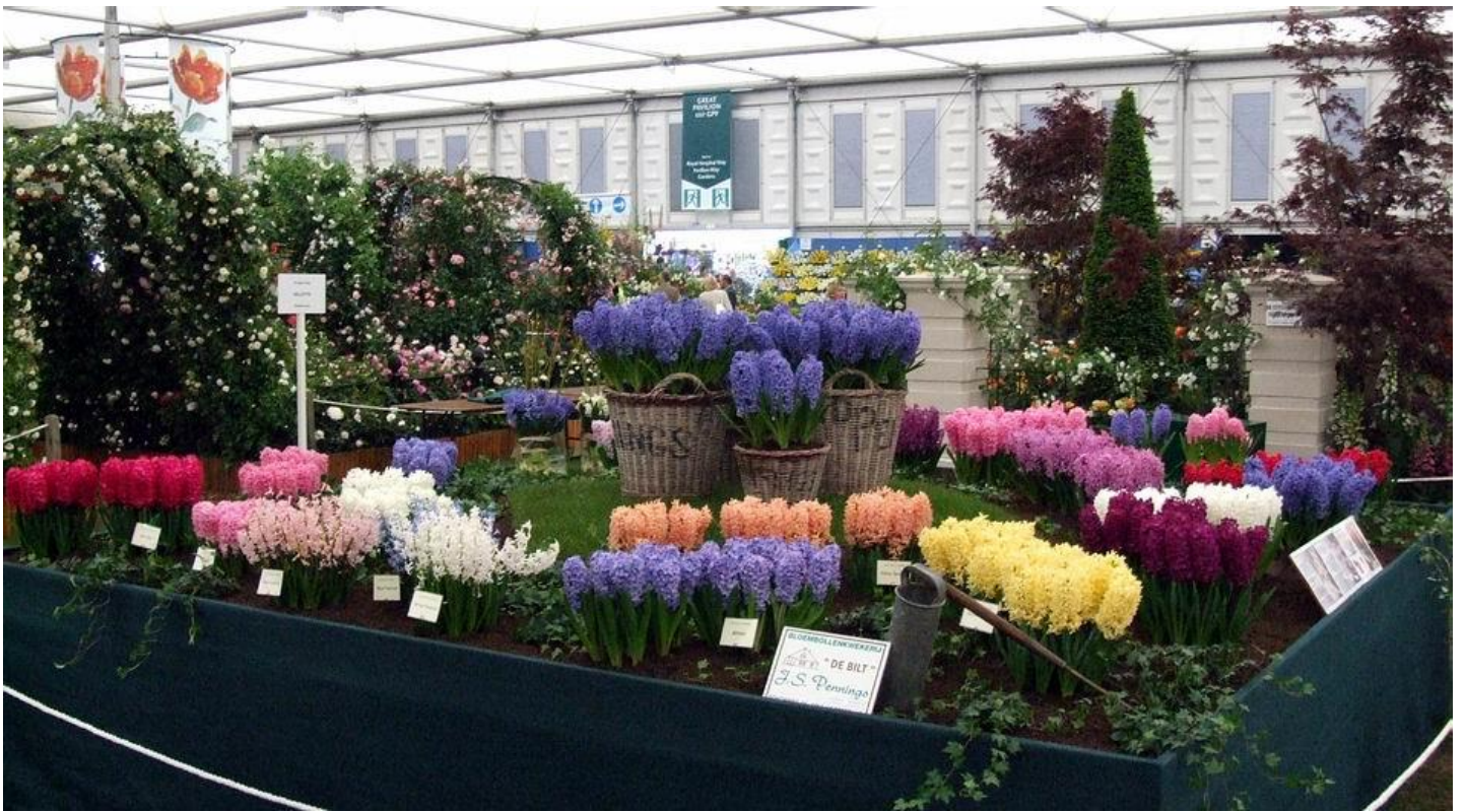
J.S. Pennings Hyacinths

Moving on around the marquee I was struck by the visual power and strong sweet scent of this display of Hyacinths. A very different display to the Amands but I do not think they could have been displayed to better effect to show of this old favourite – the first bulb I ever grew as a child.