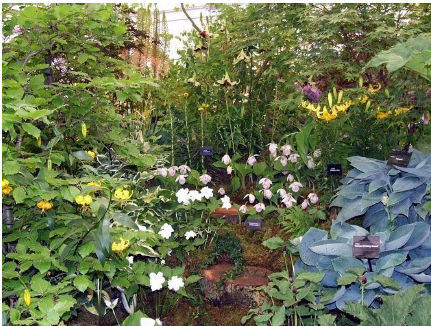
Plenty of trees and moss provide a naturalistic setting for Cyripediums and Lilies.